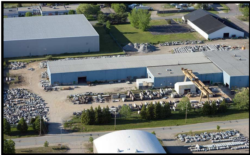
Plant & Office - North Kingstown, RI