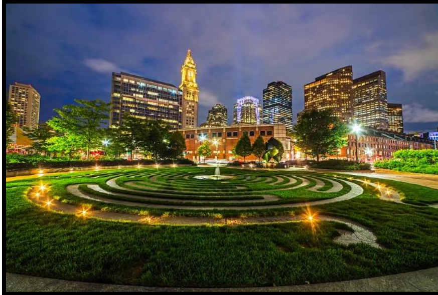
Armenian Heritage Memorial – Boston, MA